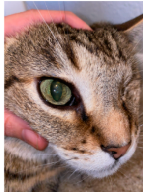
Flash on, great lighting. Perfect!